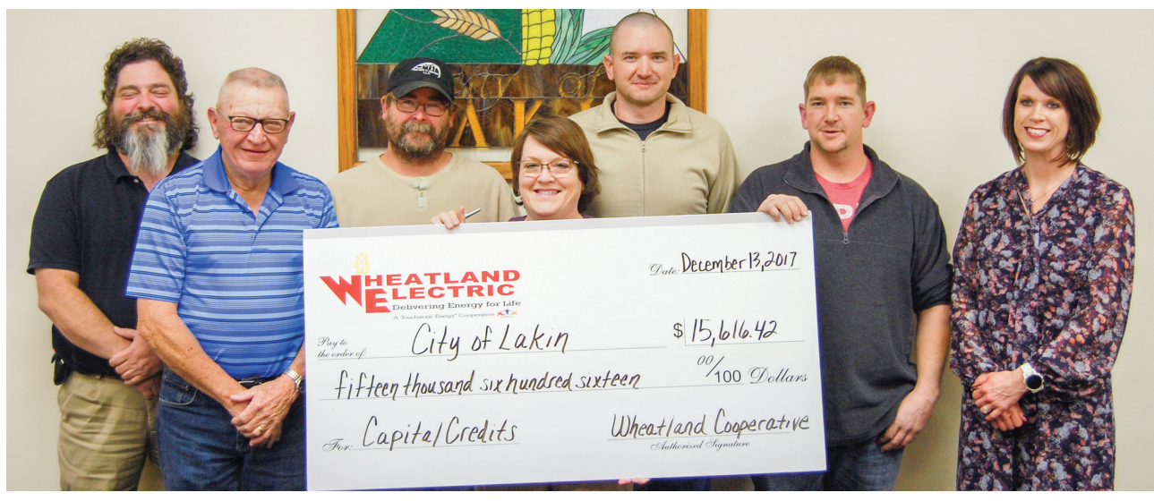
The City of Lakin received more than $15,500 in capital credits from Wheatland Electric this year.

Did you know you actually own Wheatland Electric Cooperative? As a member-owner, you are entitled to margins, also known as the Co-op's profits. This is one of the many, but perhaps most recognizable, benefits of being a member of a cooperative. Your share of the cooperative's profits are called capital credits.