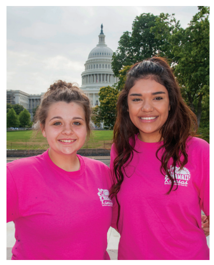
Each year, students from Kansas join more than 1,800 youth in Washington, D.C., to attend the Electric Cooperative Youth Tour. This year's Youth Tour is scheduled for June 7-14, 2018.